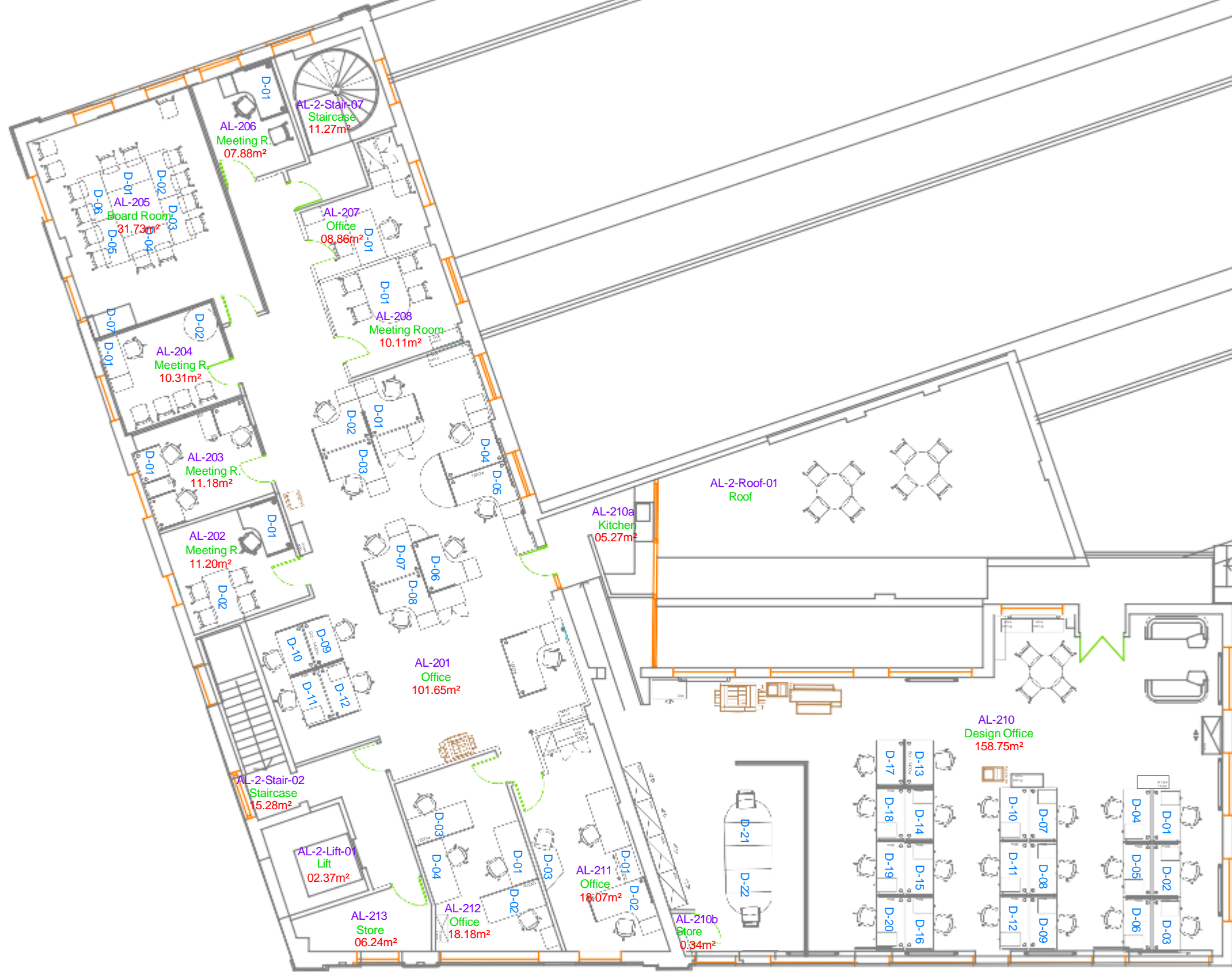
ALMA - SECOND FLOOR PLAN

This Drawing is The Copyright Of Coventry University Estates Department & Must Not Be Reproduced Without Their Permission. Figured Dimensions Must Be Taken in Preference To Scaled Dimensions & All Dimensions Must Be Verified On Site Prior To Commencing Any Works.